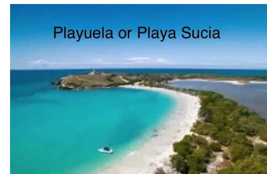
Playuela or Playa Sucia